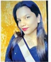
The Accused, Prema