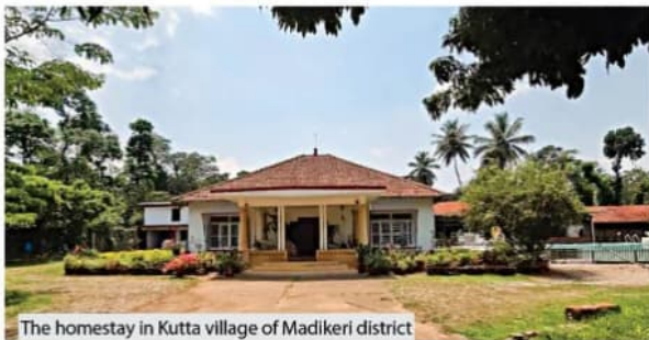
The homestay in Kutta village of Madikeri district

For now, the arrests mark the first step. But the larger reckoning, as recent history shows, may be far more complex.