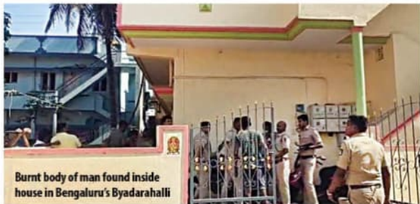
Burnt body of man found inside house in Bengaluru's Byadarahalli

Because behind every statistic is a relationship that went wrong. And in too many cases, it is ending in death.